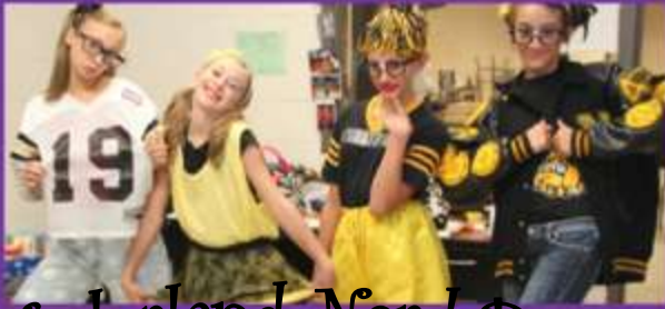
Nederland Nerd Day

Mid County Madness brought out the best in teachers and students, alike. Nederland Nerd Day and the pep rally were the biggest hits. The pep rally had skits, high school students, Spirit Club, choir, band, and Class competitions: airplane flying, longest paper chain and balloon burst. It was certainly Fun for all.