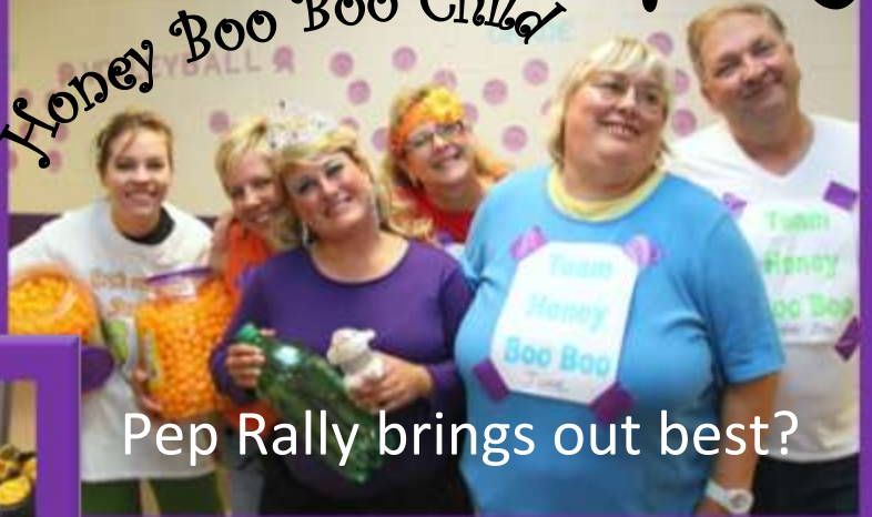
Pep Rally brings out best?